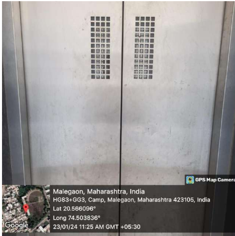
Lift facility for Specially abled