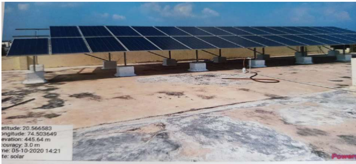
Roof top Solar