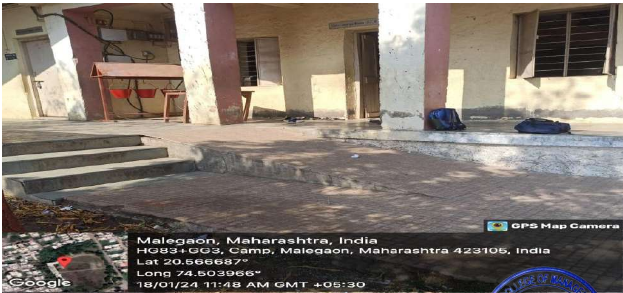
Ramp facility for Specially abled